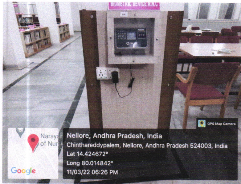
Biometric device for student entry and exit in Library (2022)

website: www.narayanannursingcollege.com || e-mail: narayana_nursing@yahoo.co.in